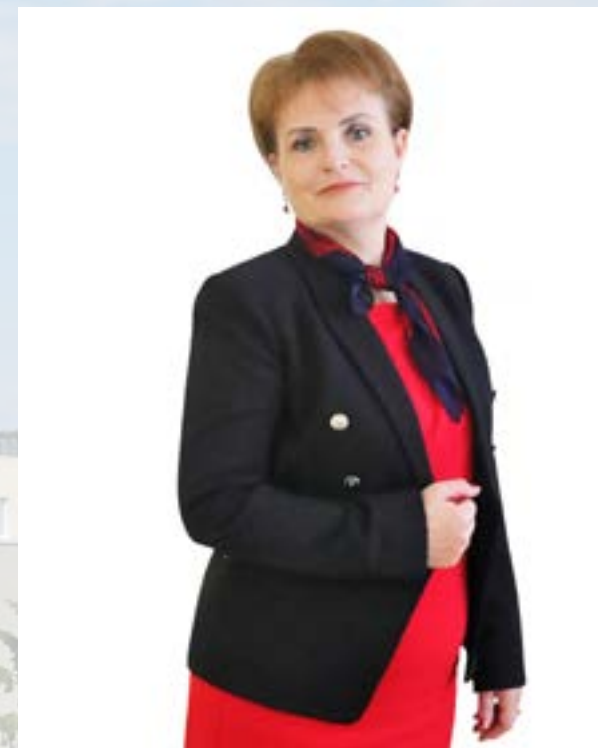
Rector, Ph.D. in Economics, an Associate Professor

Our graduates achieve great success in their professional activities; and new career opportunities open up for them.